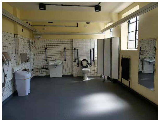
Inside the Changing Places