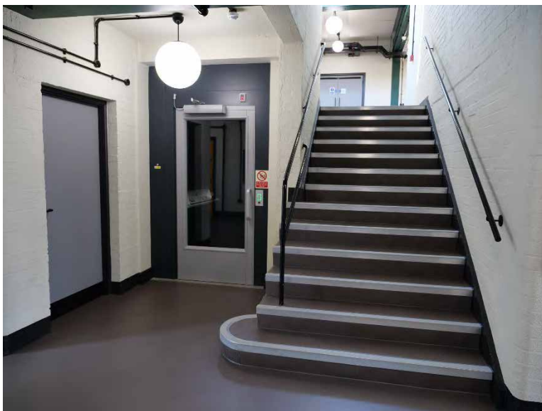
Stairs from ground floor to mezzanine floor, including lift.

The whole building is evenly lit by natural, LED and fluorescent lighting.