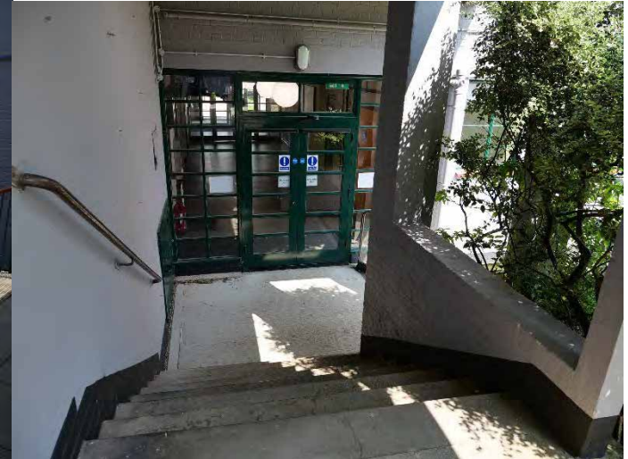
Leaving The Learning Centre towards Block A