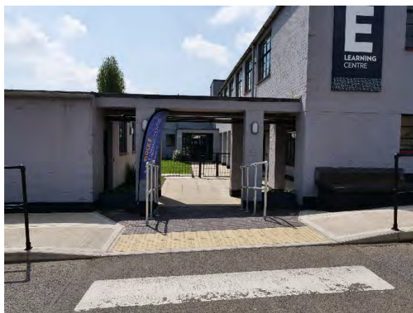
The front arch entrance of Block E Learning Centre

The Block E Learning Centre front entrance is behind a fence with secure gates. Access to the area can either be through the front arch, by the Learning Reception Office, or by the gates next to Coach Bay 1. The path through the front arch has a slight downslope and has handrails. The front entrance is step free.