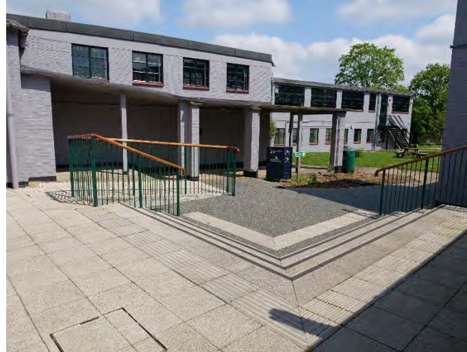
Leaving Block A toward the Learning Centre

The back entrance, from Block A or B, can be accessed either by a step-free route, with a slight downslope, or by going down a set of three steps and then eight steps, both with handrails. The surface leading from Block B lobby is slightly uneven.