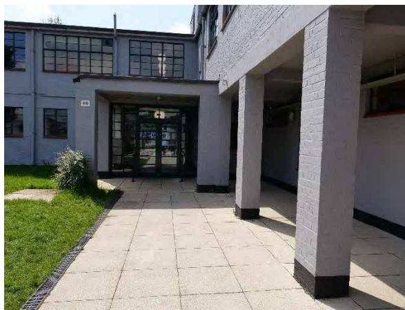
The main entrance to Block E Learning Centre