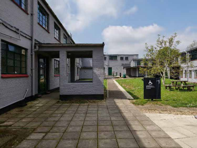
Step free path to back entrance of Block E Learning Centre