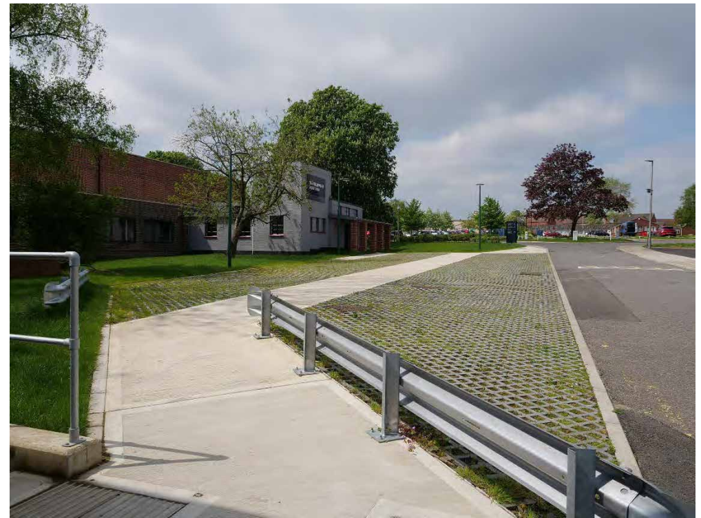
Coach Bay 2 (outside The Fellowship Auditorium)