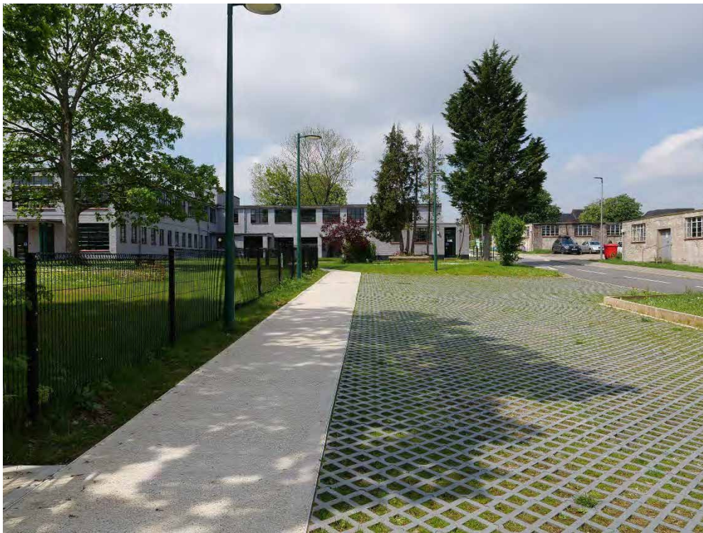
Coach Bay 1 (outside Block E Learning Centre)

The building has two purpose-built coach bays situated parallel to the Learning Centre and the Fellowship Auditorium. The coach bays are made of permeable material and allow vehicles to park near the adjacent footways. The footways and coach bays are both at road surface level. The footways are wide concrete surfaces that allow easy access to the buildings.